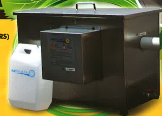
AUTO SERIES Continuous Automatic Grease Removal System